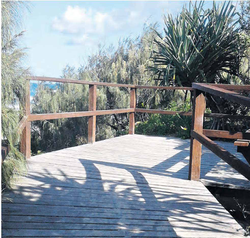
The viewing platform in Victory Park, Peregian Beach which was built after funds were secured via an anonymous donation.

suitable for disabled and aged residents and visitors to enjoy beach scenery. This required a solid rather than a sandy pathway to access the platform. After many years and much wrangling with bureaucrats, the platform and pathway were built. The platform provides a meeting place with fabulous views of waves and whales while protecting the dunes from trampling and erosion.