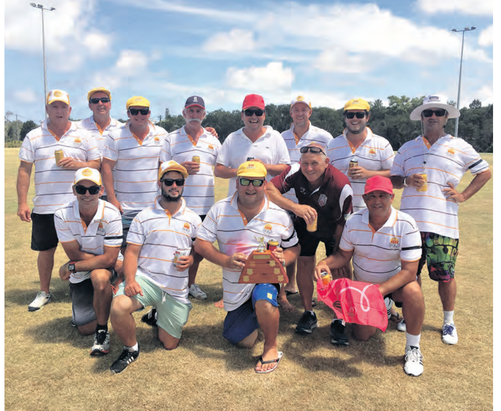
The Coolum Beach Hotel cricket team after a previous win on Australia Day. Both teams will be hoping for a win, however the main winners are the charities that the family friendly cricket match between the Pub and Bowlo will be fundraising for.

"Look, the pub usually stack their side, but we are going to be looking great in our new shirts provided by our sponsor North Shore Realty, so it will be a fun day to sit back and enjoy and see which side wins whilst supporting two great charities in Coolum," Ian said.