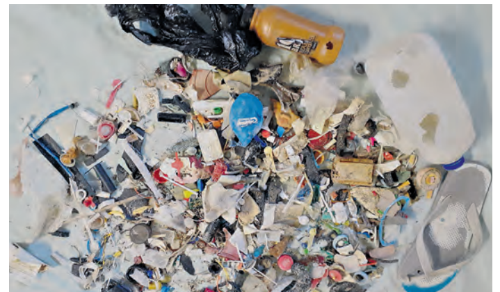
Protecting the environment is paramount and preserving the natural state. This picture shows just how much more there is to do, with this litter collected at Marcoola Beach on June 26.

On the Parliament front, last-minute amendments to Bills created sleepless nights and queried our processes, again. The sought limits to election signage by this community through our polls were diluted to the point where it could not be supported.