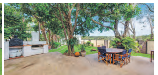
1 Taylor Street MARCOOLA