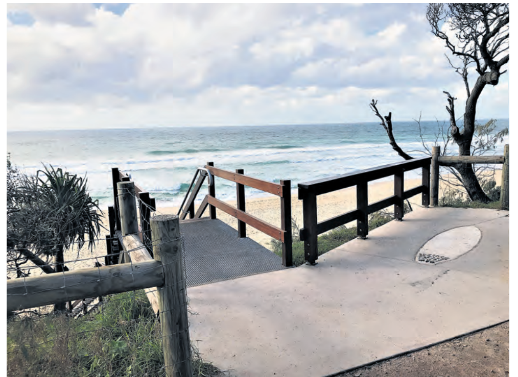
A new look and feel coming for Geeribach Lane.

GEERIBACH LANE in Yaroomba is set to be transformed, with construction underway to improve access and safety for all road users. Improvements include reconstructing and sealing the existing gravel car park area and creating nine marked public parking bays. Geeribach Lane will also be resealed between the car park and Yinneburra Street. Sunshine Coast Council Division 8 Councillor Jason OPray said the works were the