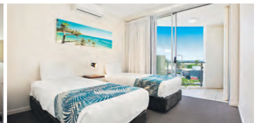
3308/923 David Low Way MARCOOLA