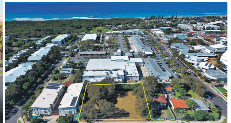
36-40 Sunrise Avenue COOLUM BEACH