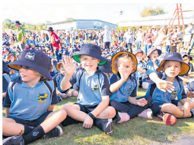
School students waving farewell.