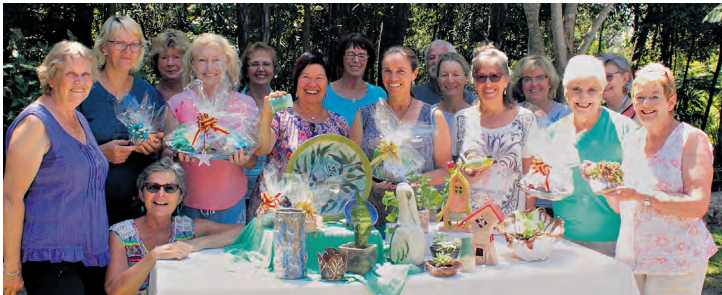
Clayden Potters from Coolum who were the lucky recipients of a $27,500 gambling grant which will be used to upgrade their studio and install solar. The potters are pictured in the lead up to their annual open day and fundraiser in late 2018.

MORE THAN $160,000 has been shared by local community groups in the latest round of the Gambling Community Benefit Fund.