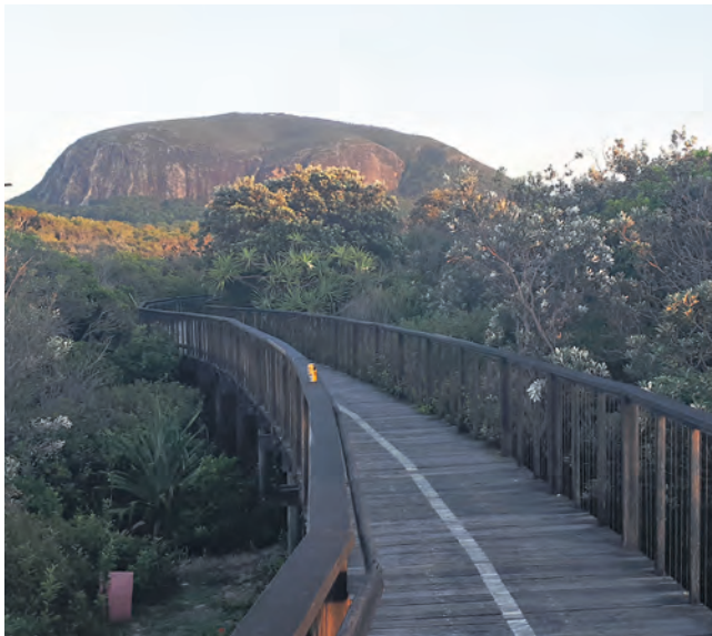
Take this isolation time to explore our region such as a morning sunrise or walk along the boardwalk at Mount Coolum.

It is a challenging time and I respect the efforts of our government leaders in setting out the policies and regulations to help deal with the spread of COVID-19. I also respect the decision of people to go into a full lockdown as well as being eternally grateful for our health workers and people who continue to work in essential services to ensure we can be sustained as