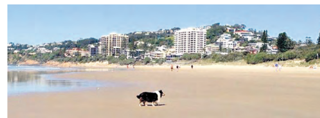
It is hoped that our beautiful beaches will not be closed as a result of people not adhering to the directives of council - that morning walk to take in the sunrise, or walk with the dog or surf could be lost if these rules are not taken seriously by all.

We love our beaches here and hope that the reckless actions of others do not see them being closed. Please take the advice from SC Council seriously and pass it on.