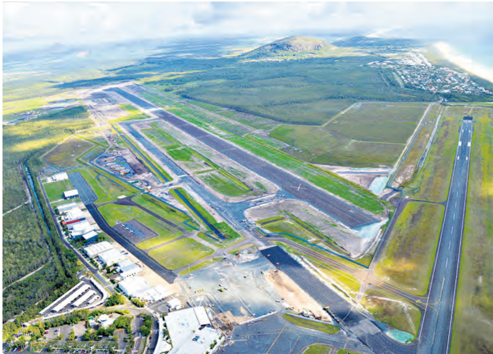
An aerial view of the new Sunshine Coast Airport runway which is scheduled for its first landing and departure on May 21.

THERE are less than 100 days until the official opening of the Sunshine Coast Airport's new runway – a historic milestone for our region which is set to change the face of local tourism, business and export, and connect our Sunshine Coast with the world.