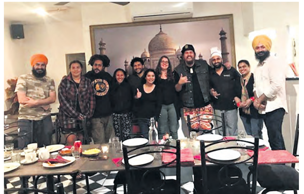
Local band OKA enjoying the Indian dinner flavours at Tandoori Flames.

COOLUM is home to a smorgasbord of flavours from around the world and located on Birtwill St is the best Indian restaurant on the Sunshine Coast, which has been serving