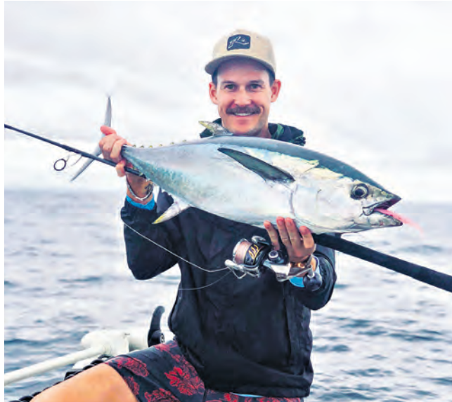
Tuna season is fast approaching with decent catches a real possibility with the right know how.

Now this can play a big part in coming back with a full esky or standing on the bow of the boat cursing at schools of fish as they bust up in front of you. When the tuna are in these feeding modes they can become fixated on a particular size of baitfish, so matching the hatch is a must. Small metal