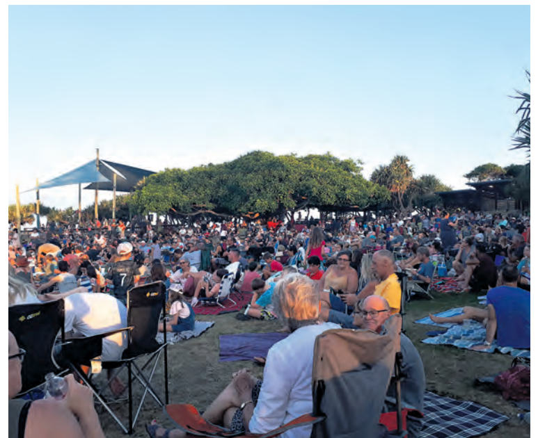
People enjoying the free 'Flicks in the Park' held in Tickle Park over the holidays.