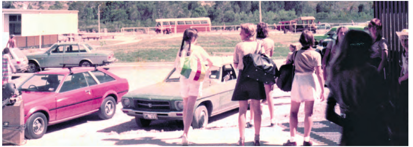
Coolum State High School students leaving for home on completion of the first day of the school being open in 1985.

The new school was centred around the First Year Centre, where most classes were held, and where the teachers' staff room was located. The Manual Arts and Home Economics building stood to one side, and the Office building (which