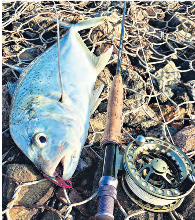
A nice trevally caught with a fly on the Maroochy River.

ting out on the water this week then don't forget to drop by Mike's Fishing and Tackle on Aerodrome Road