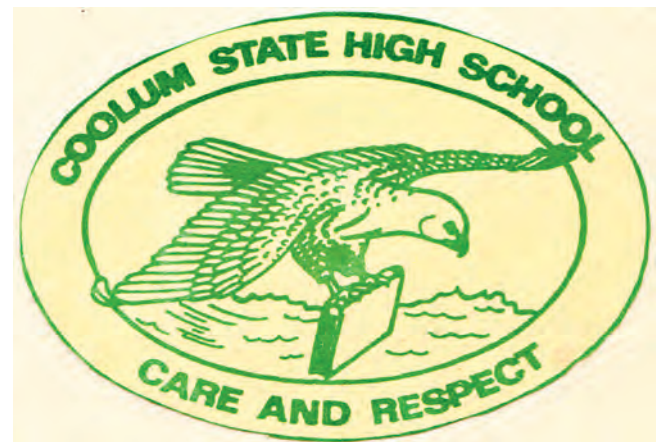
The Coolum State High School logo.

Coolum High School – we are proud of you... and we are so glad that your uniforms now match your sophisticated, impressive presence in our community.