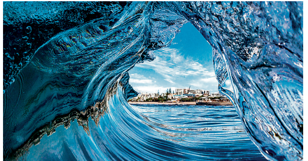
Have you got what it takes to help shape the future of the evolving coastal landscape of the Sunshine Coast? Council are seeking expressions of interest from residents who want to join an advisory board that will look at how council adapts to the impacts of coastal hazards moving forward.