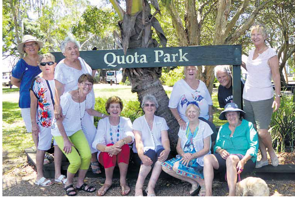
Members of Quota Coolum Beach celebrating Quota Internationals 100th Birthday at Quota Park Noosaville.

Added to this are the crochet poppies that the ladies make each year to be sold by the Coolum RSL on Remembrance Day, amongst many other community minded fundraisers – the women do not stop with