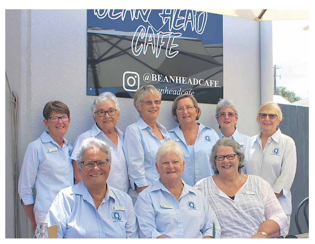
The ladies from Quota Coolum Beach who regularly meet at cafes around the region to socialise and keep connected.