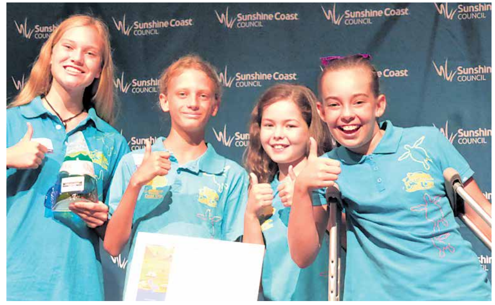
Coolum and North Shore Coast Care Junior Eco-Leaders were the lucky recipients of an Australia Day Award. The junior eco warriors have helped their adult counterparts with tree plantings, enviro education and making homes for bees as well as many other environmental programs.