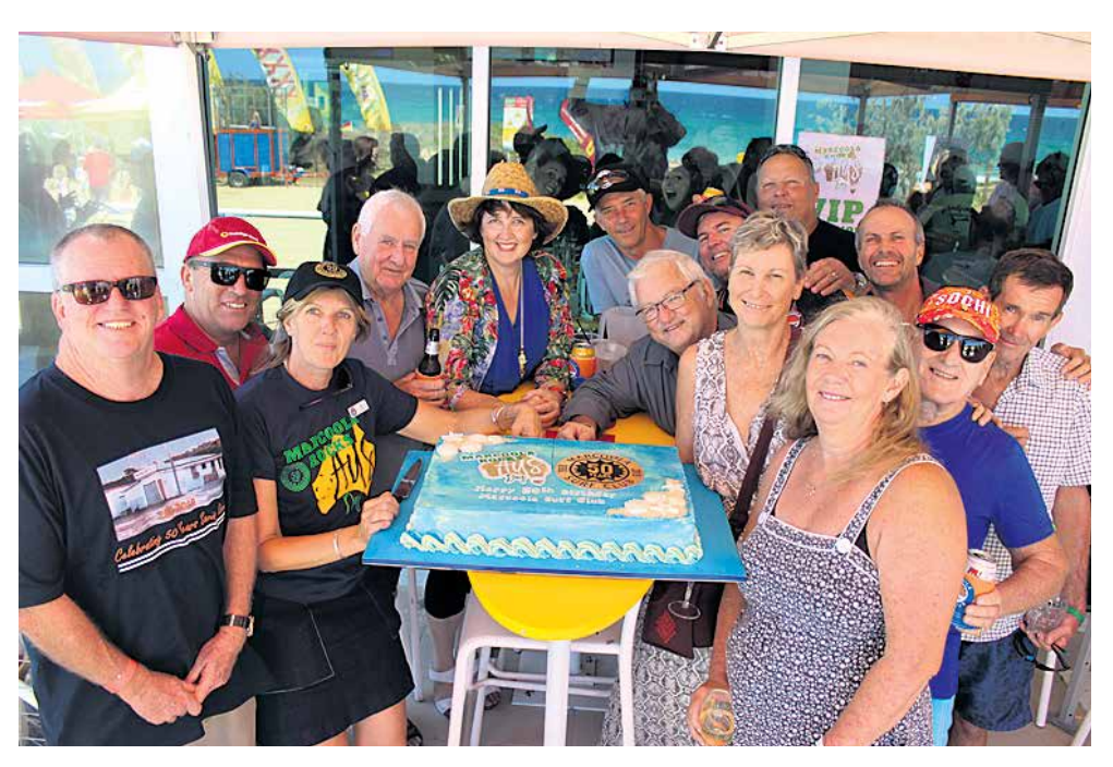
Life members and special guests cut the cake at Marcoola SLSC on Australia Day to celebrate the club's 50th birthday.

MARCOOLA Surf Club was the place to be on our national day, where two rousing renditions of Happy Birthday broke